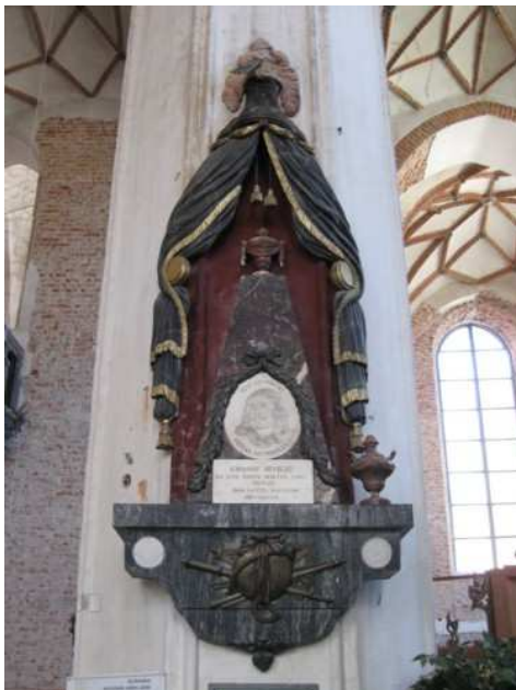
5. Johannes Hevelius' epitaph