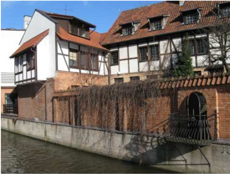
7. The picturesque part of the Old Town