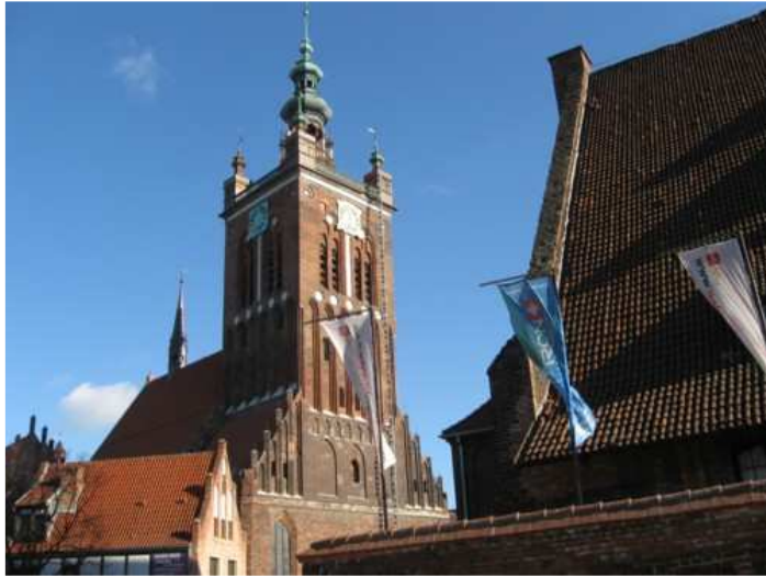
1. St. Catherine Church - the oldest parish church in Gdansk