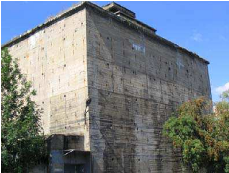
13. A gigantic air-raid shelter, built during World War II