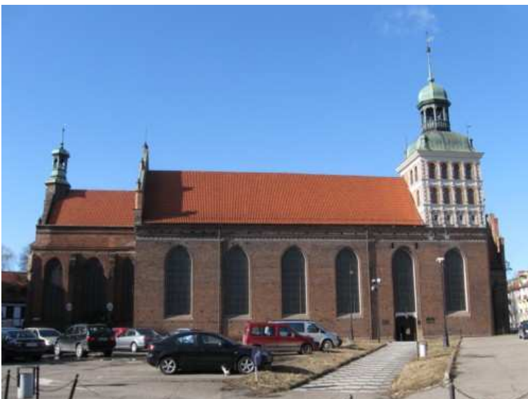
9. St. Bridget church - spiritual center of Solidarity Movement