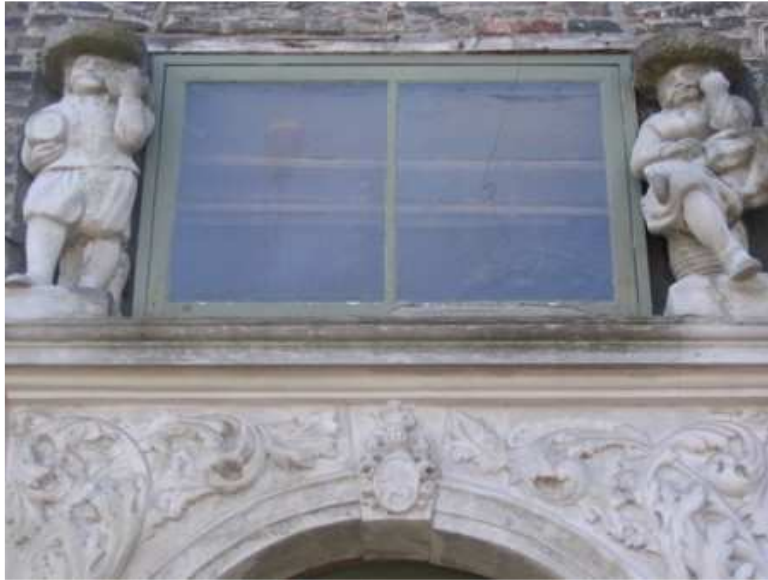
16. Authentic portal with brewers