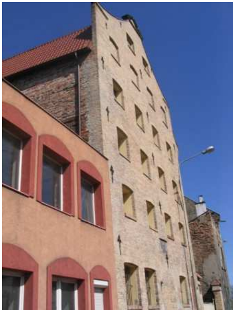
17. This part of Gdansk is known as “Zamczysko” (An Old Castle)