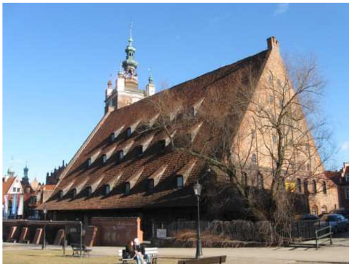
2. The Great Mill - the largest mill in medieval Europe!