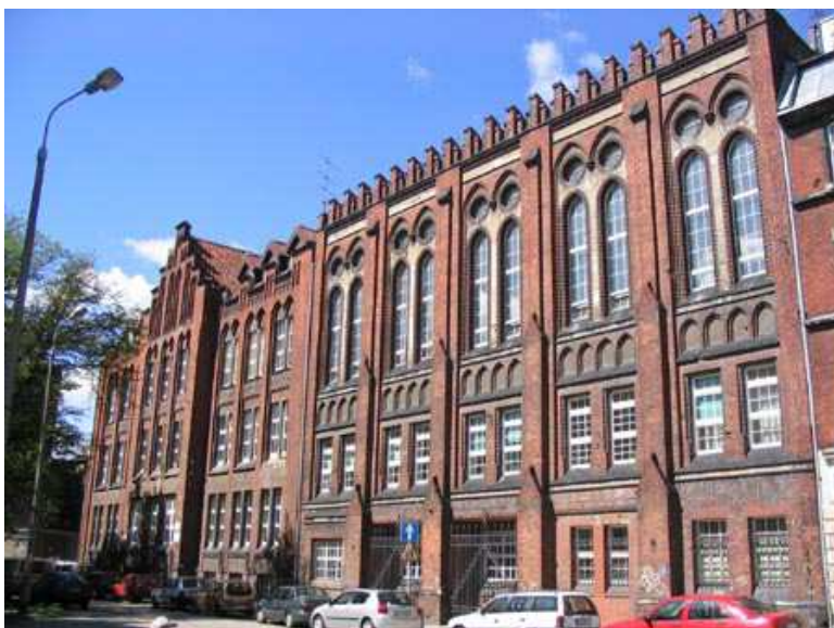
15. The historic buildings of Osiek district