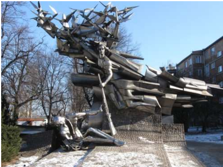
14. Monument to the Defenders of the Polish Post