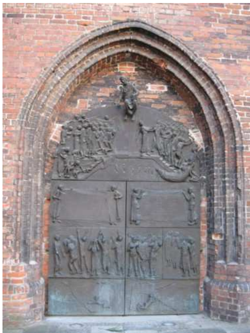
11. Intricately carved doors - description of the history of Solidarity Movement