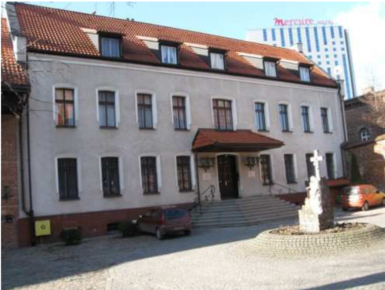
8. Presbytery of St. Bridget church - a meeting place for anti-communist opposition