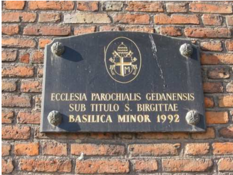
10. In 1992 St. Bridget Church was awarded the title of minor basilica