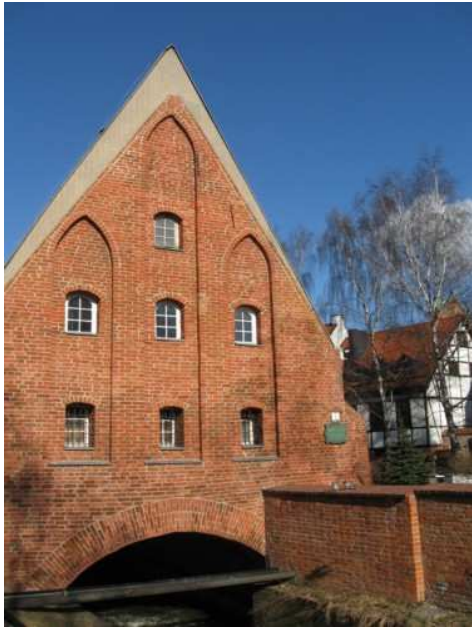
4. The Small Mill