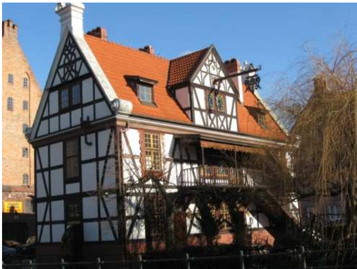
3. Reconstructed Miller House