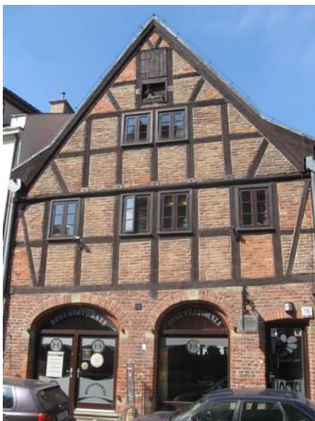
18. The Deer Granary at Grodzka Street - building of the eighteenth century