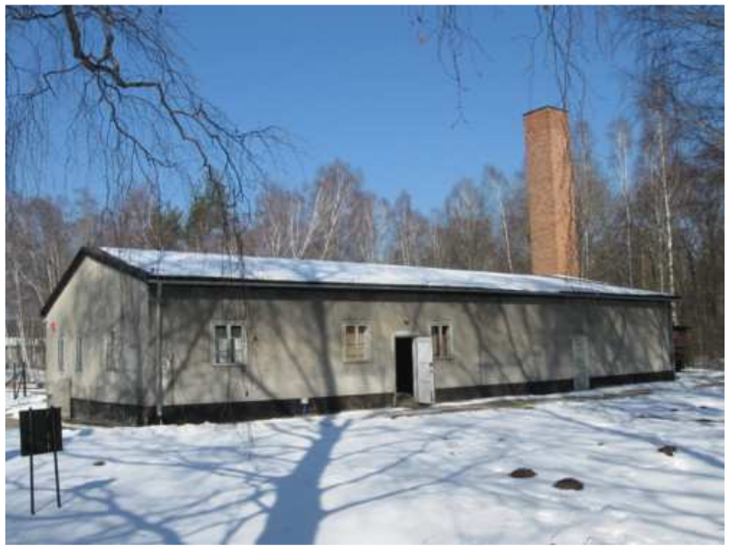
10. The crematory building - for many prisoners the only way to freedom