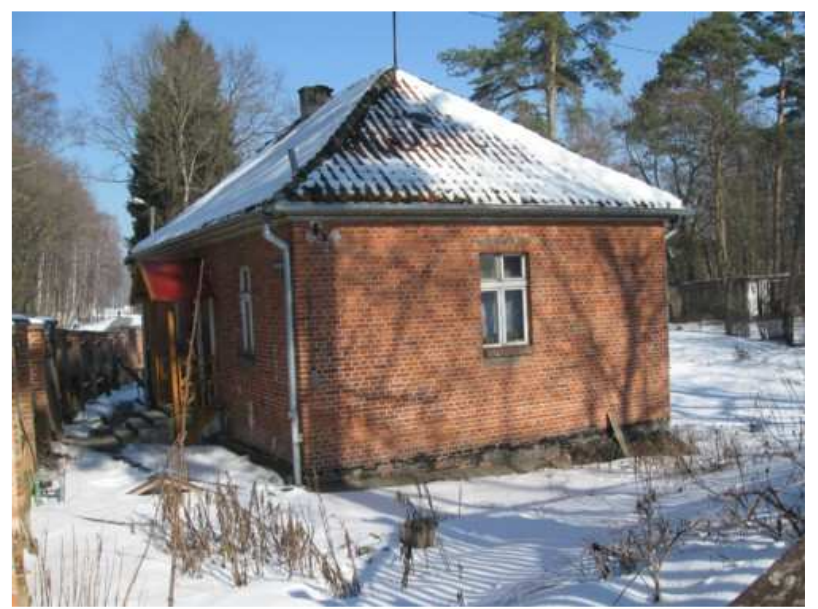
4. The Kennel building. A guard dog was heavier than the starving prisoner