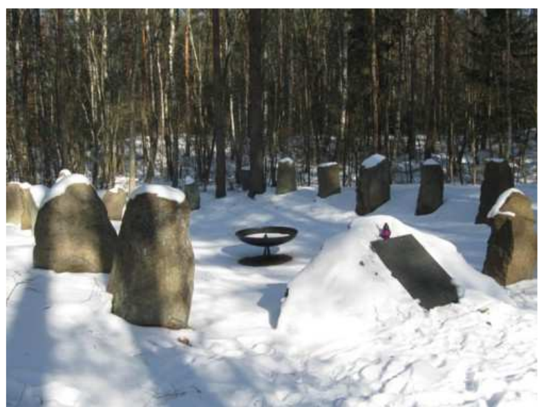
13. The funeral pyre