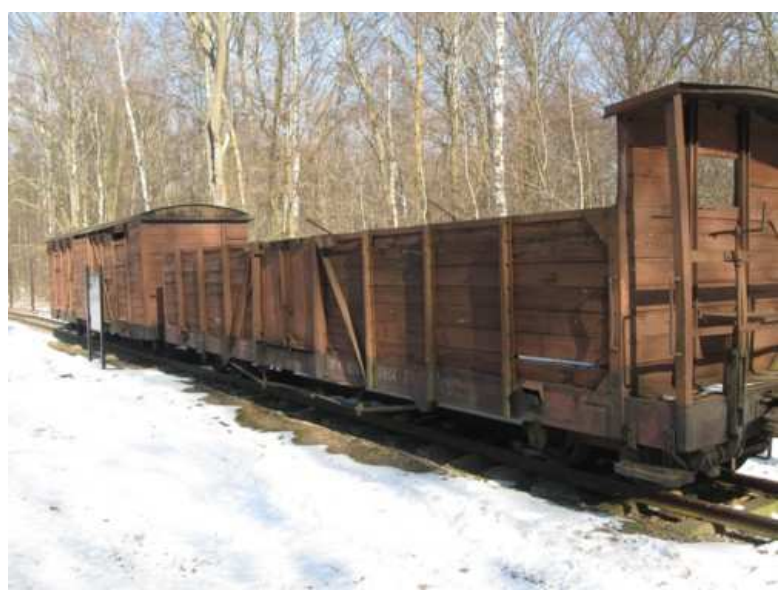
9. Narrow-gauge railway wagons