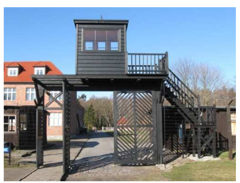
5. The Death Gate