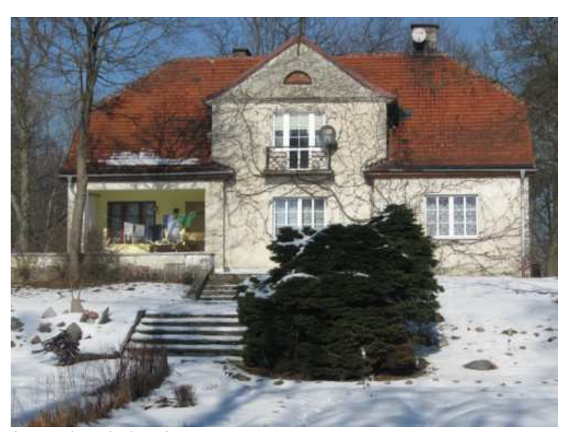
2. In this building lived the local camp commandants