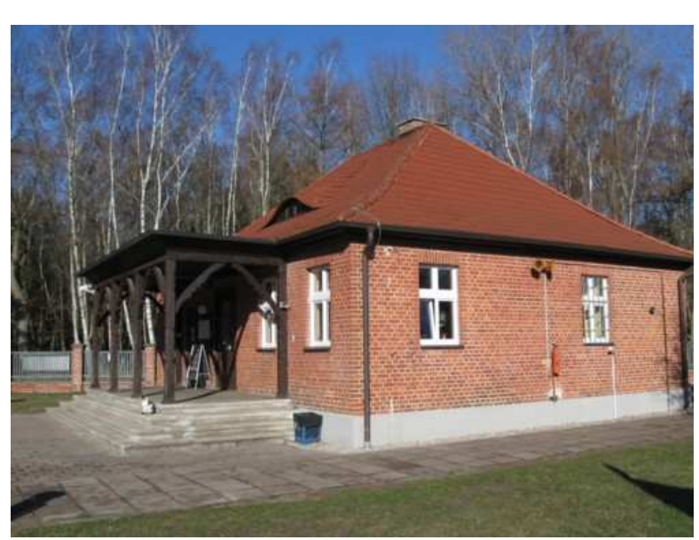
3. Former SS Guard Post, now Visitors' Service