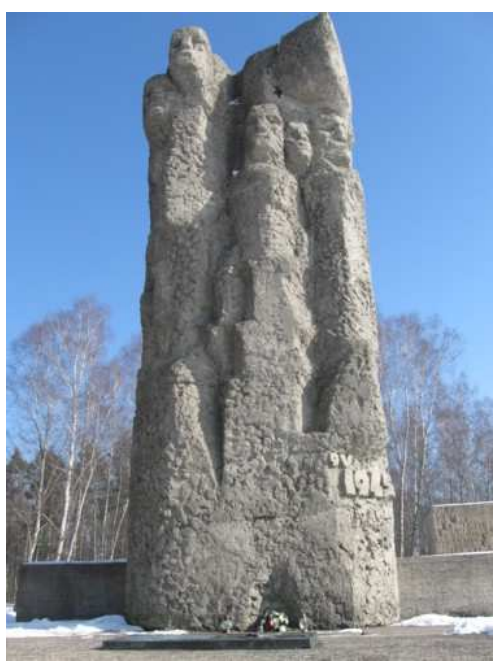
12. The vertical part of the Monument to the Victims and Martyrdom