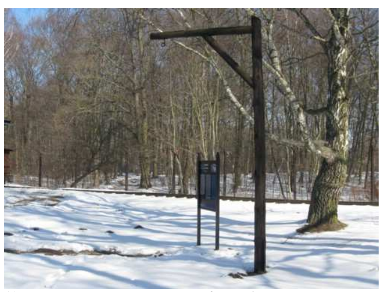
11. The camp gallows - secret place of execution