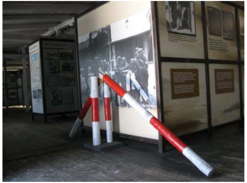
7. The broken barrier - expressive symbol of the start of World War II